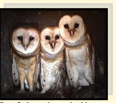
Barn Owls nesting again this year in the old hand dug well!

Many Thank's to all who helped make this a Party to Remember.